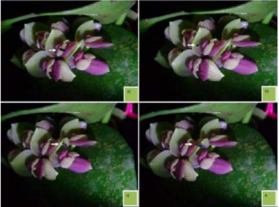
FIGURE 4. Visit sequences of Bradysia sp. in Pleurothallis marthae flowers. a — Bradysia sp. arriving to the petals and facing to the labellum; b — Bradysia sp. consuming nectar from the labellum; c — Bradysia sp. crossing by the column and climbing by the lower part of the dorsal sepal; d — Bradysia sp. crossing by the lower part of the dorsal sepal to exit the flower.