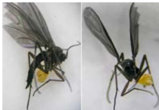
FIGURE 3. Bradysia sp. with Pleurothallis marthae pollinaria adhered to the dorsal side of the thorax.

Flower visitors. — The most common flower diurnal visitors were herbivorous caterpillars (Lepidoptera: Geometridae), which feed on buds, ovaries, and fruits in early developmental stages. We also observed adults of two Orthoptera species: Eumastacidae and Acrididae feeding on flowers and foliage. We also saw Heliconius