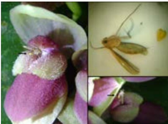
FIGURE 5. Mycetophila sp. with pollinaria of Pleurothallis marthae . a — Mycetophila sp. in a flower of Pleurothallis marthae with a pollinarium in the ventral part of the thorax. b — Close up of Mycetophila sp. and pollinarium. The pollinarium was detached of the insect during the specimen manipulation.

pollination activity was obtained from the collection from the field of these diptera species with P. marthae pollinarium attached.