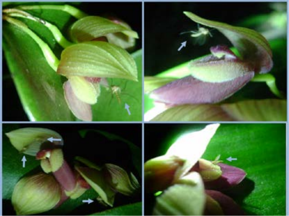
FIGURE 6. Display of Mycetophila sp. in Pleurothallis marthae flowers.