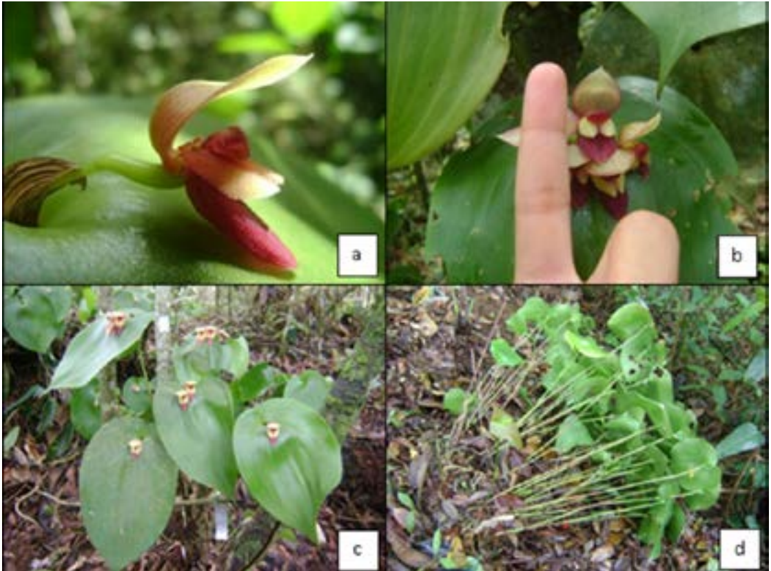
FIGURE 1. Flower of Pleurothallis marthae : a) lateral view, b) frontal view, c) two color morphs, d) Habit of Pleurothallis marthae .

photographic records. Flower visitors and pollinators were differentiated by behavior. Floral visitors were collected in plastic vials, transported to the zoology laboratory at Universidad of Caldas where high resolution macro photos were taken. As Colombian law prohibits exportation of wild biological material, Dr Sarah Siqueira de Oliveira, at the University of São Paulo identified the specimens from the photographs.