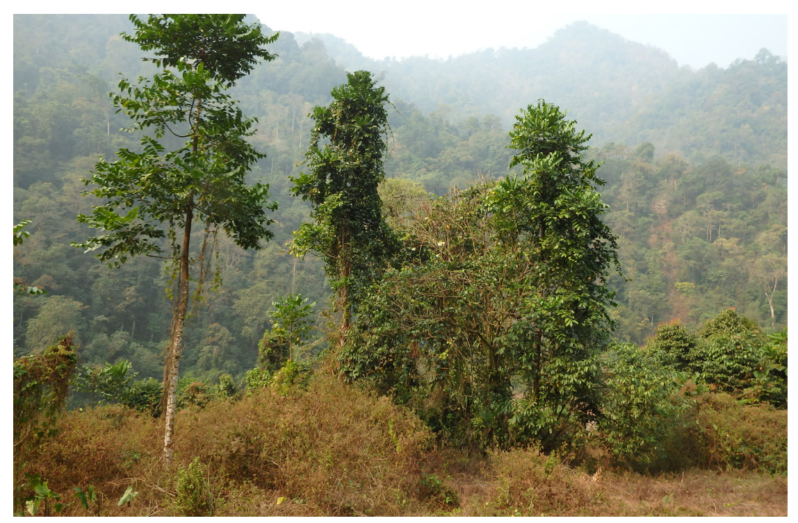
FIGURE 7. Natural habitat of Chiloschista gelephuense , growing epiphytically on Beaumontia grandiflora (the messy looking vine in the center), and on Aphanamixis polystachya to the right in this little cluster of trees.

DISTRIBUTION: Chiloschista gelephuense is currently only known from the original type area near the Tshachu hot springs north of the city of Gelephu in