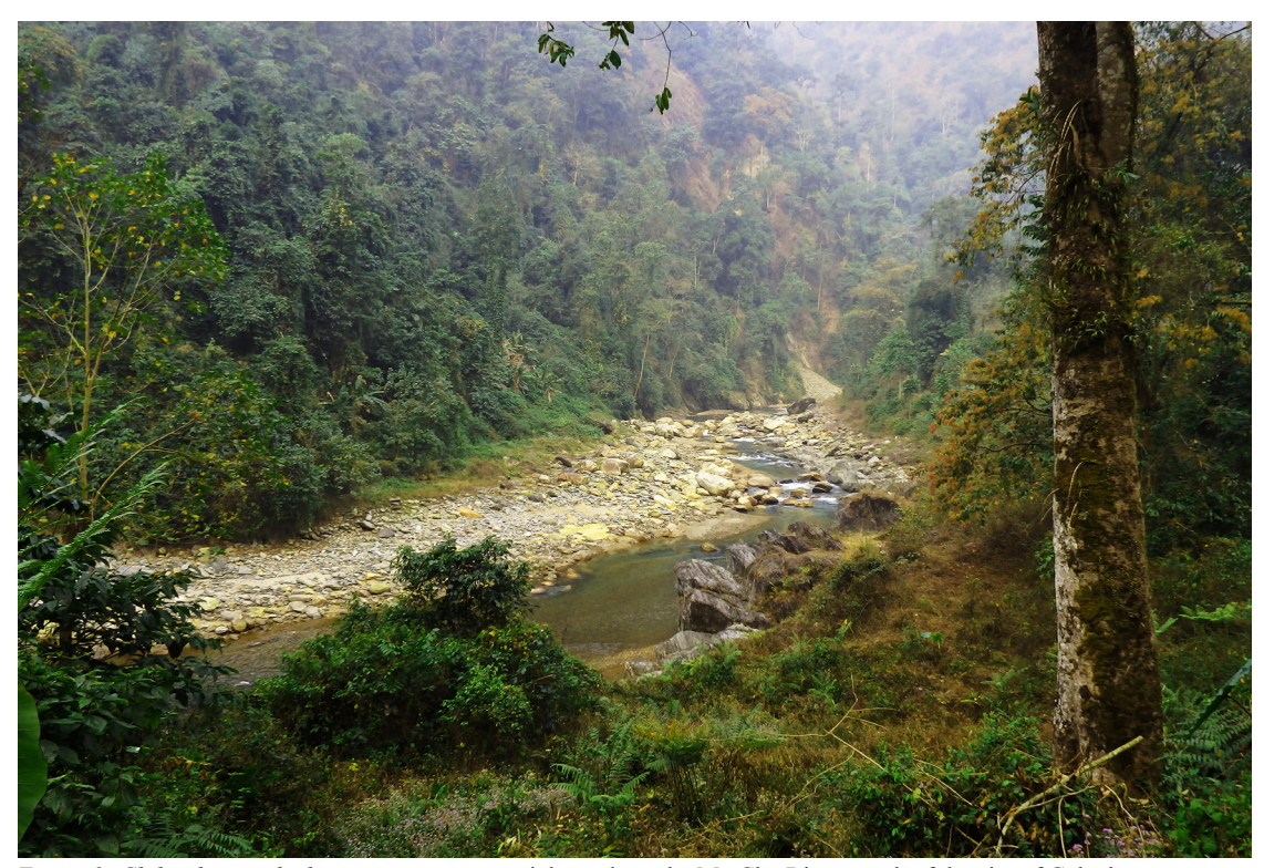
FIGURE 2. Chiloschista gelephuense grows as an epiphyte along the Mo Chu River, north of the city of Gelephu.

We realize that the name "Chiloschista parishii" is frequently used in various publications for species that share the coloration of the flowers (yellow with brown spots) but differ in other characteristics and in reality represent different species (Pearce & Cribb 2002, Gurung 2006, Raskoti 2009) some of which remain to be scientifically described and named. It is not the present authors' ambition to deal with that subject in this current paper, but we will focus on some of these other species in future articles when more material is available. The original collection of what became Chiloschista parishii was made by Reverend Charles Samuel Pollock Parish (#55), presumably in the "Moulmein" area of Myanmar. For some reason unknown to us, his name's initials are listed as "E.