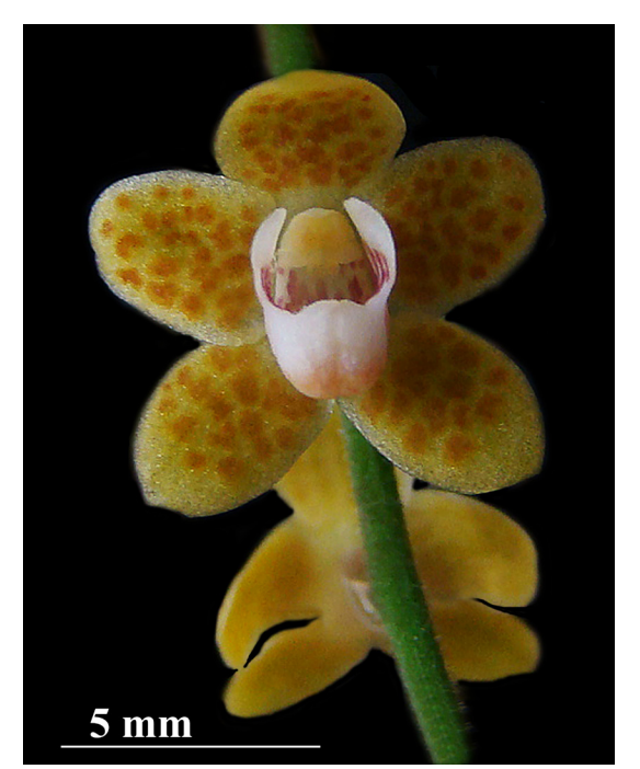
FIGURE 6. Chiloschista parishii from Myanmar, sold at a local border market in western Thailand.

rigidly attached to the column foot, deeply saccate and slightly canaliculated ventrally, tri-lobed, lateral lobes erect to indistinctly curved inwards, apically rounded, front-lobe short, fleshy, indistinctly bi-lobed and labiate, slightly recurved, 6.0-6.5mm high and 5.5-5.8 mm wide; callus a fleshy, broad and micropubescent swelling, from the base up to the base of the front-lobe, with a pair of low more or less ovoid, glandular pubescent swellings on each side, apically divided into a pair of fleshy knobs, with some glandular micro-pubescence in between; column very short and stocky, ca. 1.5–2.0 mm long, excluding the anther cap and the column foot, 2.0-2.2 mm long; anther cap light yellow, galeate with a pair of hairlike, ca. 1 mm long tendrils on each side; pollinarium of 2 obliquely globose and indistinctly flattened, cleft pollinia on a narrowly rectangulate triangular stipe, ca. 1 mm long on a sub-quadrate, indistinctly concave viscidium.