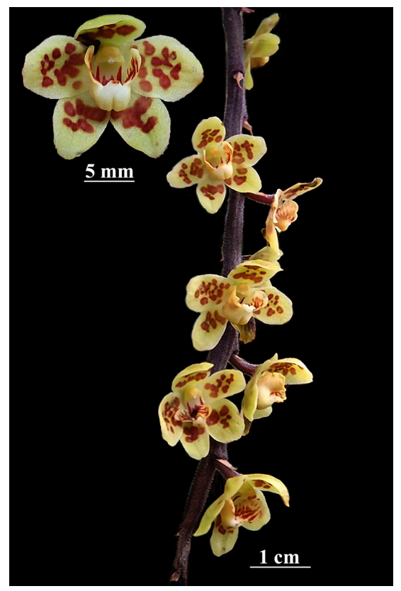
FIGURE 3. Chiloschista gelephuense flowered in cultivation at the Royal Botanic Garden, Serbithang, in May of 2015.

Epiphytic herb . Roots numerous, spreading, terete to slightly flattened, 2–3 mm in diameter. Stem reduced, virtually absent. Leaves seasonal in the wild during the rainy period, not seen on the type. Inflorescence sub-erect to pendent, 15–16 cm long, almost straight to indistinctly flexuous, micro-pubescent, laxly